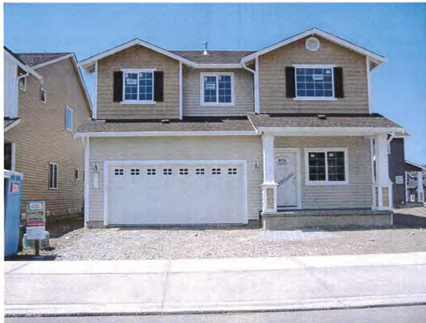
Lot 78 East Face 06-30-08