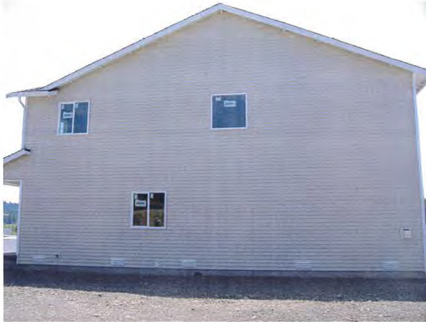
Lot 78 North Face 06-30-08

If using the Elevation Certificate to obtain NFIP flood insurance, affix at least two building photographs below according to the instructions for Item A6. Identify all photographs with: date taken; "Front View" and "Rear View"; and, if required, "Right Side View" and "Left Side View." If submitting more photographs than will fit on this page, use the Continuation Page, following.