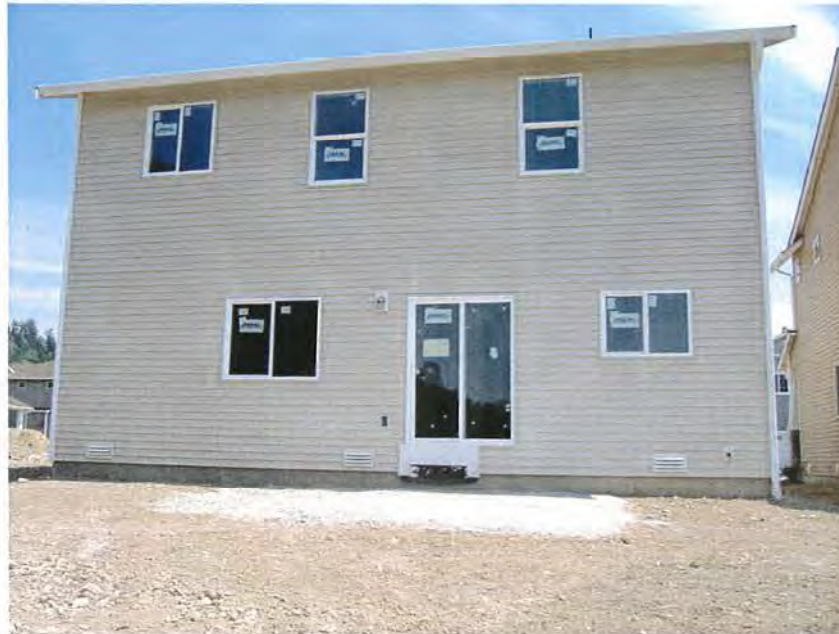
Lot 78 West Face 06-30-08