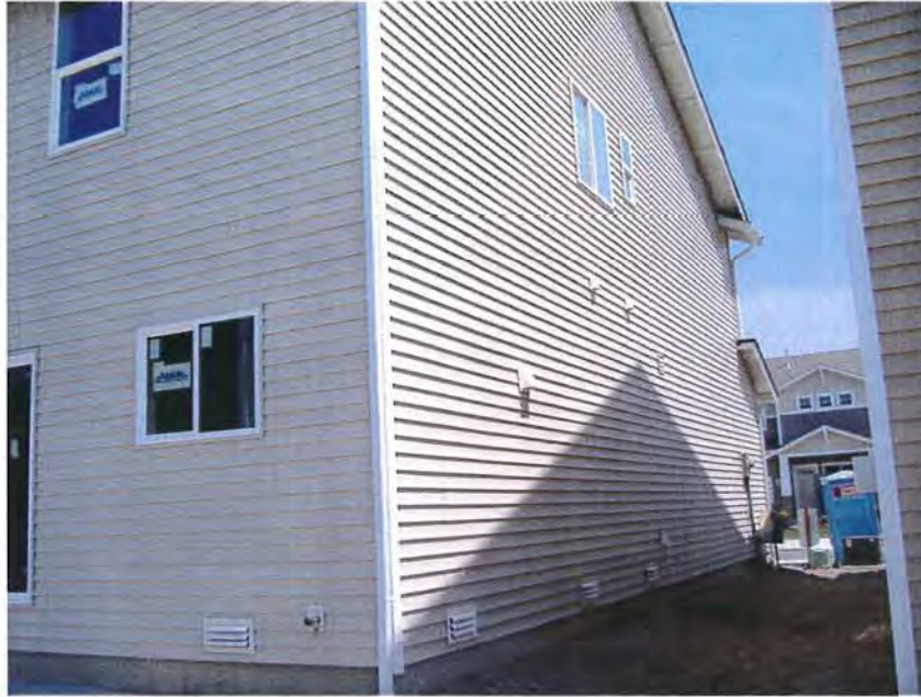
Lot 78 South Face 06-30-08

If submitting more photographs than will fit on the preceding page, affix the additional photographs below. Identify all photographs with: date taken; "Front View" and "Rear View"; and, if required, "Right Side View" and "Left Side View."